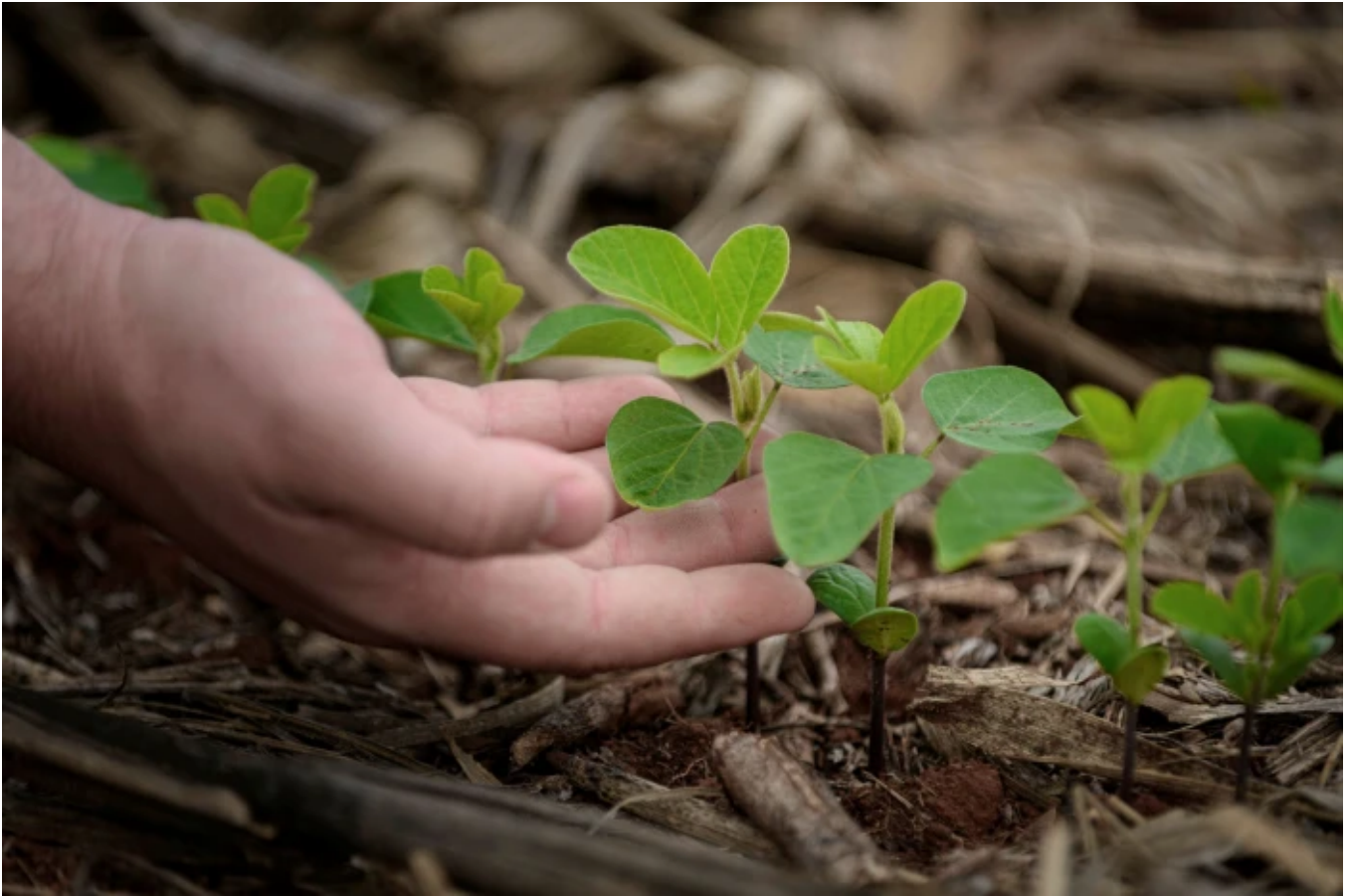
Soya seedlings cultivated by SLC, which uses weed-detecting cameras to minimise herbicide use

Farming already accounts for 22 per cent of the Brazilian economy and seems poised for an even brighter future, with demand for food forecast to soar as the global population pushes towards 10bn by 2050 , according to UN estimates.